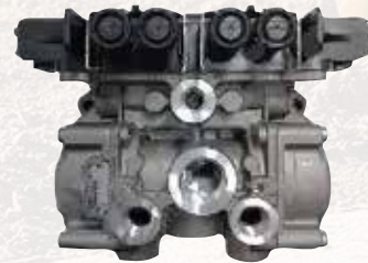
4005001030 WABCO 4S/2M ABS VALVE (no core required)