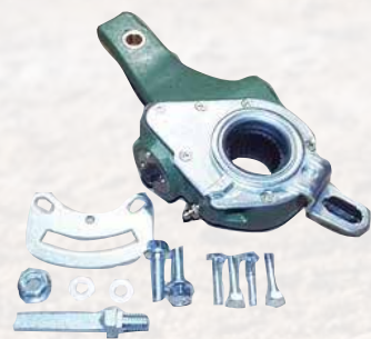
HALDEX STYLE SLACK ADJUSTER 5.5 OR 6" CENTER