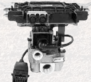
4005001010 WABCO 2S/1M ABS VALVE (no core required)