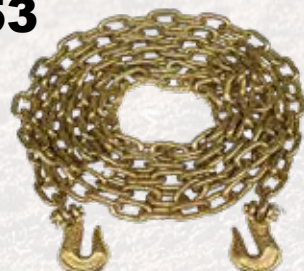
3/8x20FT GR70 CHAIN w/ CLEVIS GRAB HOOKS