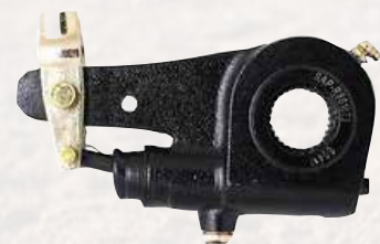
MERITOR STYLE SLACK ADJUSTER 5.5 OR 6" CENTER